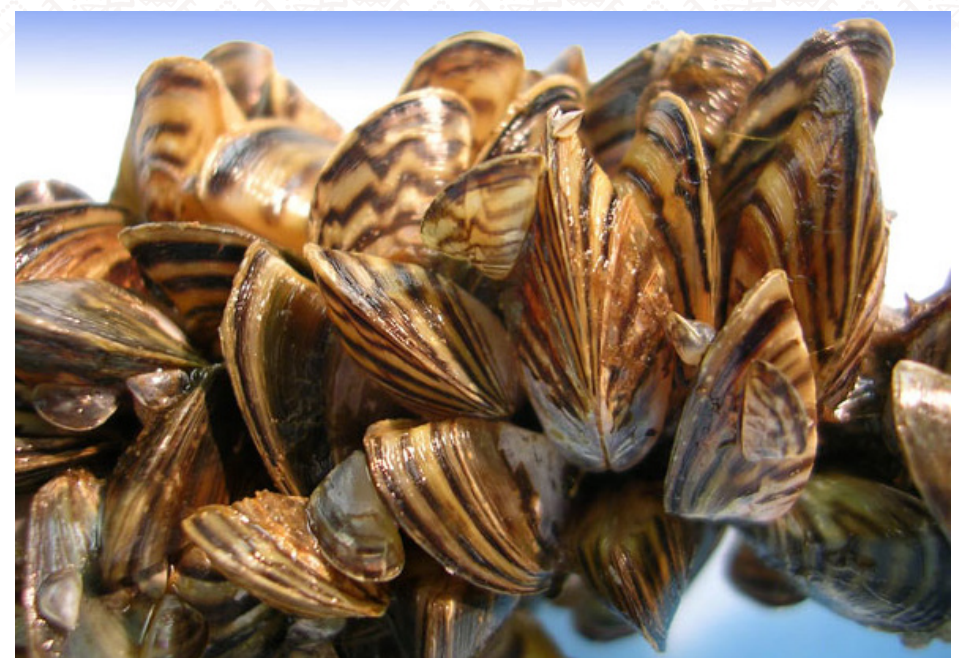
Zebra Mussels.

The state also developed the Regional WID Data Sharing System, now the main method of communication among inspection stations and managers. The system is now performing watercraft inspection and decontamination in 10 western states, as well as for numerous local governments, national parks, and private industry. It consists of a mobile application for field personnel, a website for managers and a shared database. The system, which sends out real time alerts when infested watercraft are moving into uninfested waters, has directly resulted in more interceptions preventing new invasions.