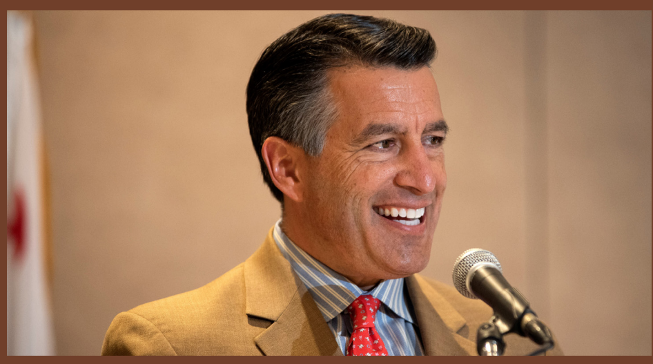
Nevada Gov. Brian Sandoval noted in his keynote that invasive species "can interrupt the very social fabric of the West."

spoke and highlighted how "Western Governors are using their convening power and energy to confront the scourge of invasive species. The impacts of invasive species in the West are as pervasive as they are underreported. "