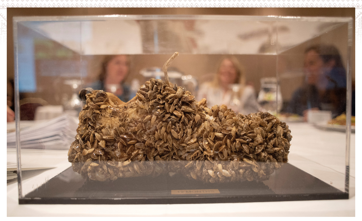
A shoe encrusted with invasive mussels vividly illustrates the impact of the rapidly spreading invasive species.

Since it first emerged in the U.S. in 1999, West Nile virus has infected at least 17,737 people and caused 1,654 deaths.9 Chronic wasting disease, an emerging infectious disease that is fatal to free-ranging and captive deer and elk, has been discovered in 24 states and continues to spread.10 In Hawaii, invasive fungal pathogens are resulting in Rapid 'Ōhi'a Death, a vast die-off of endemic 'Ōhi'a trees that are crucial to Hawai'i's ecosystems and culture. The emerald ash borer has killed hundreds of millions of ash trees in North America and has caused lasting damage to native and urban forests since 2002.11 In Guam, the coconut rhinoceros beetle caused the native fadang tree, once the most abundant tree in Guam's forest, to be placed on the endangered species list in 2015.12 The beetle was detected in Hawaiii in 2013 in the area around Pearl Harbor and has been contained to that area thus far. The beetle is now threatening the native coconut palm, a tree central to the environment, economy, and culture of Guam, Hawai'i and other Pacific Islands.