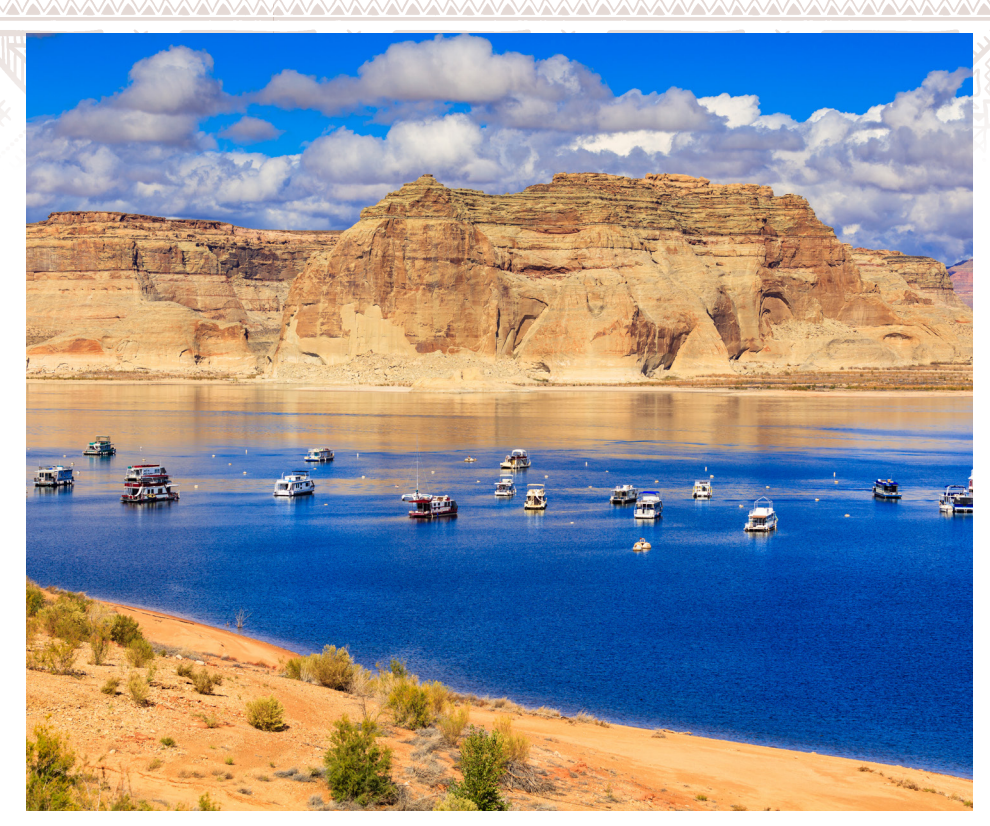
The Utah Division of Wildlife Resources is working with the Arizona Game and Fish Department and the National Park Service at Lake Powell.

The changes quickly resulted in improved inspections and decontaminations, a significant decrease in the number of boats found with mussels aboard upon subsequent inspections, and spawned a partnership between UDWR, the Bureau of Reclamation, and the National Park Service to conduct research studies examining the viability of both larval and adult mussels passing through different types of ballast pumps. Study results indicated that adult mussels can easily survive passage through ballast pumps, spurring further research studies and critical analysis of current decontamination protocols.