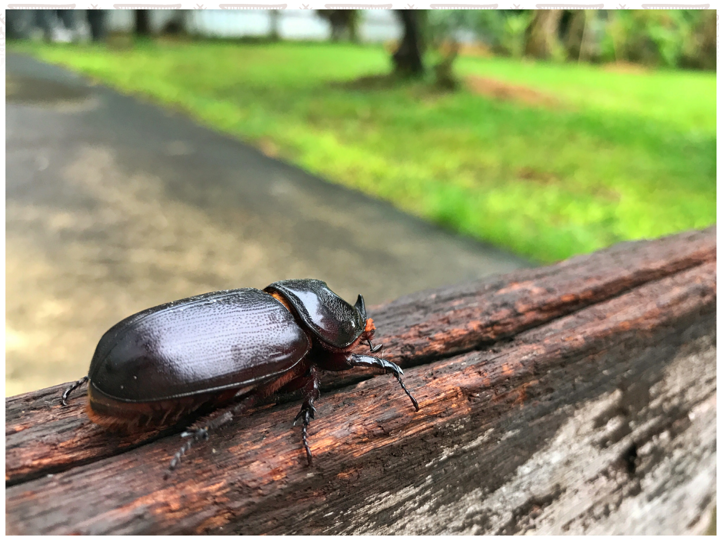
Coconut Rhinoceros Beetle.